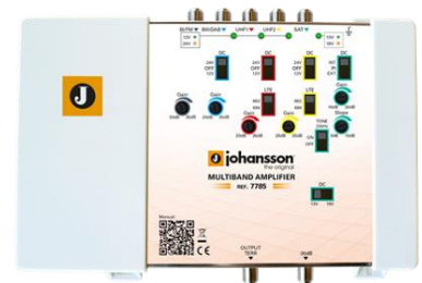
Ref. 7785 5 inputs: BI/FM, BIII/DAB, UHF1, UHF2, SAT