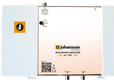
Ref. 7781 1 input: Cable