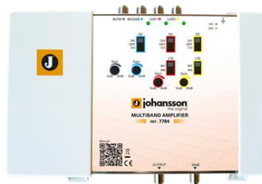
Ref. 7784 4 inputs: BI/FM, BIII/DAB, UHF1, UHF2